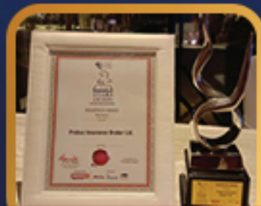
CMO Global Digital Broker of the Year 2019