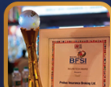
ET Now Insurtech Award 2020

Looking back at the past year with the warmest of memories, while welcoming the New Year with more vigour and motivation.