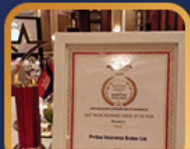
Times Network Best Online Insurance Portal 2018